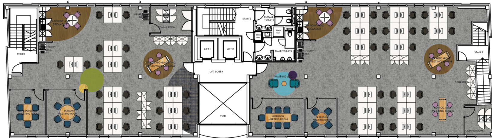
First Floor Left Hand 1776 sqft

20 1600MM DESKS 2 X 6 PERSON MEETING ROOMS 2 X PRINT COPY AREAS 1 TEAPOINT AND BREAKOUT 1 AD HOC MEETING BENCH/WAITING AREA 1 COMMS ROOM