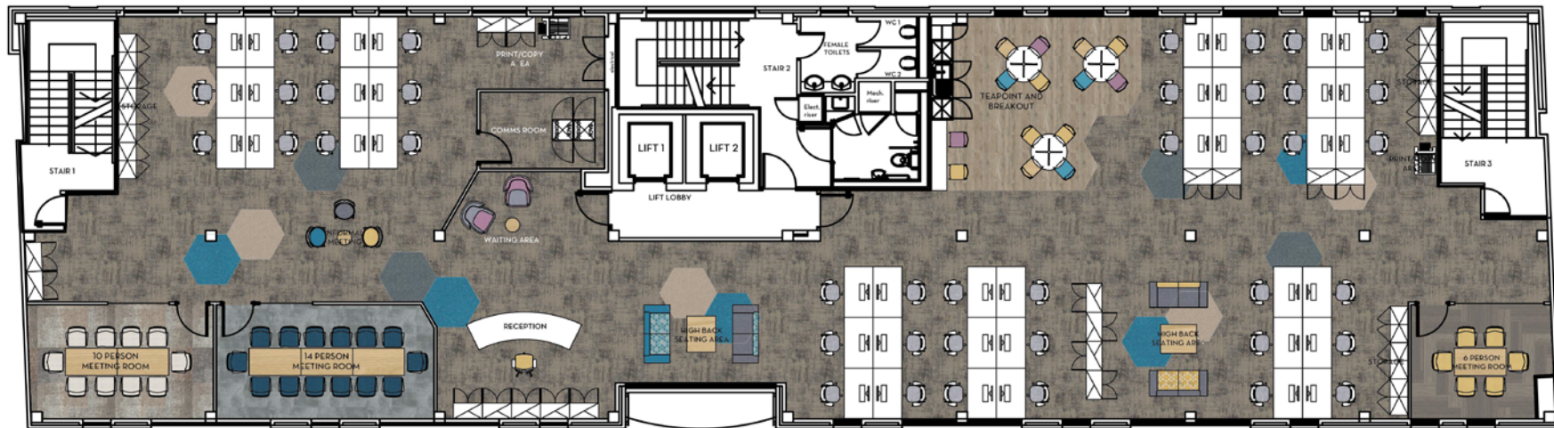
Second Floor 4,080 sqft