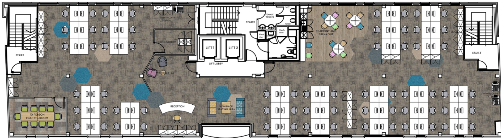
Second Floor 4,080 sqft